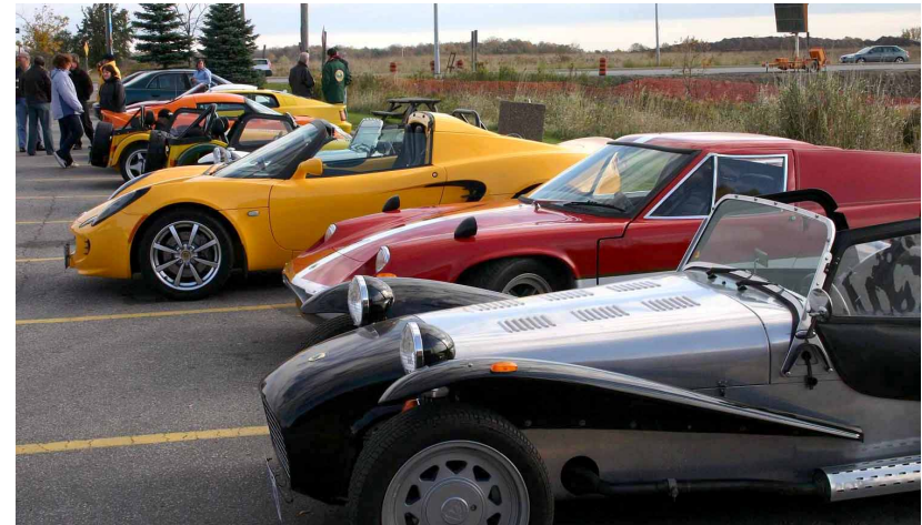
Lotus Club of Canada's 2006 Fall Run. Note the variety: Seven, Europa, two Elises, an Esprit, a Mazda. In all some 10 cars took part.