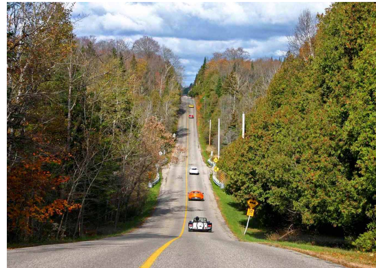
Backroads on the way to Mono Cliff; Lotus Club Fall Run, 2006.